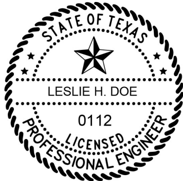
Figure: 22 TAC §137.31(c)